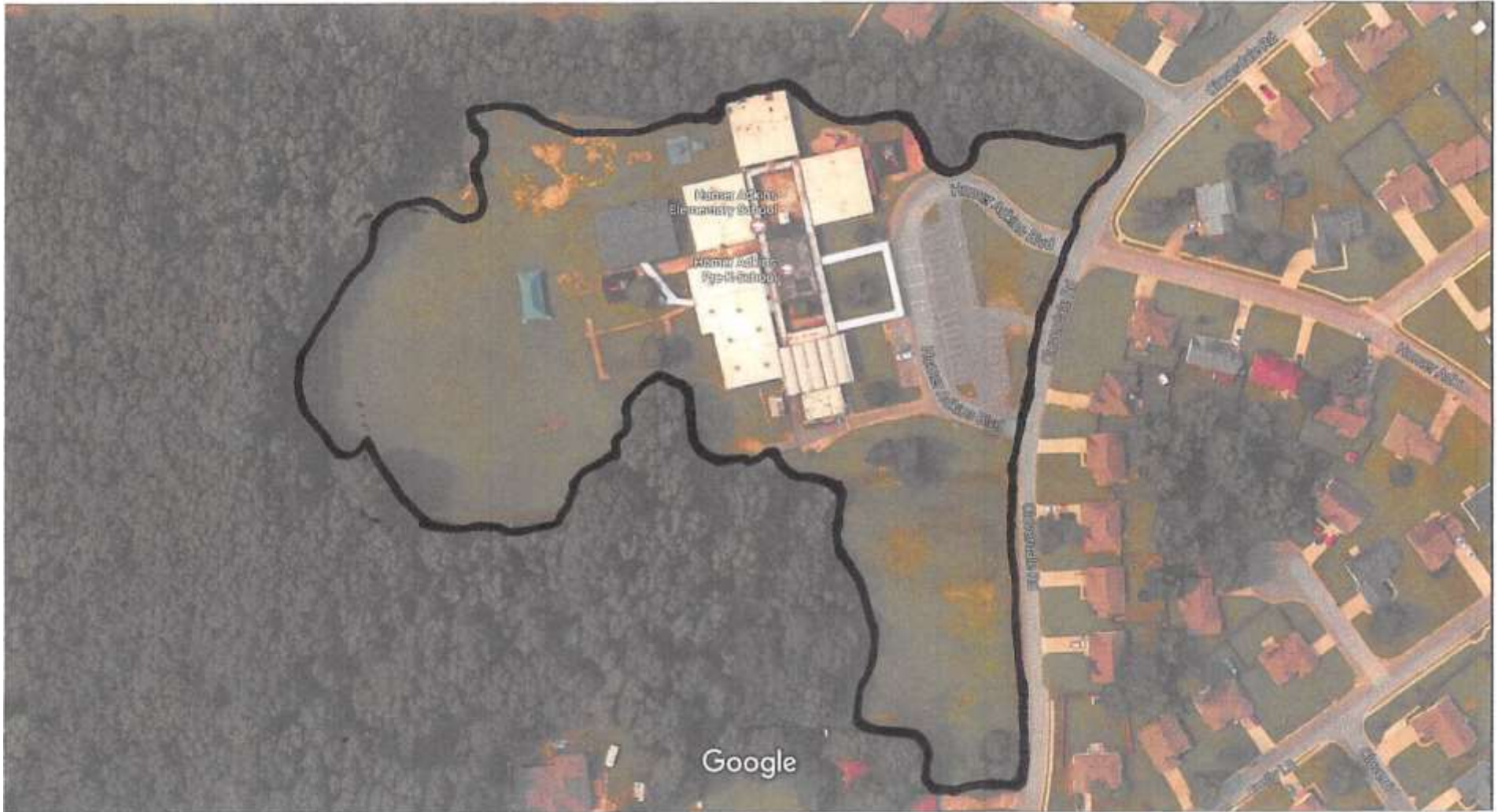
Imagery©2017 Google,Map data©2017Google 100 ft