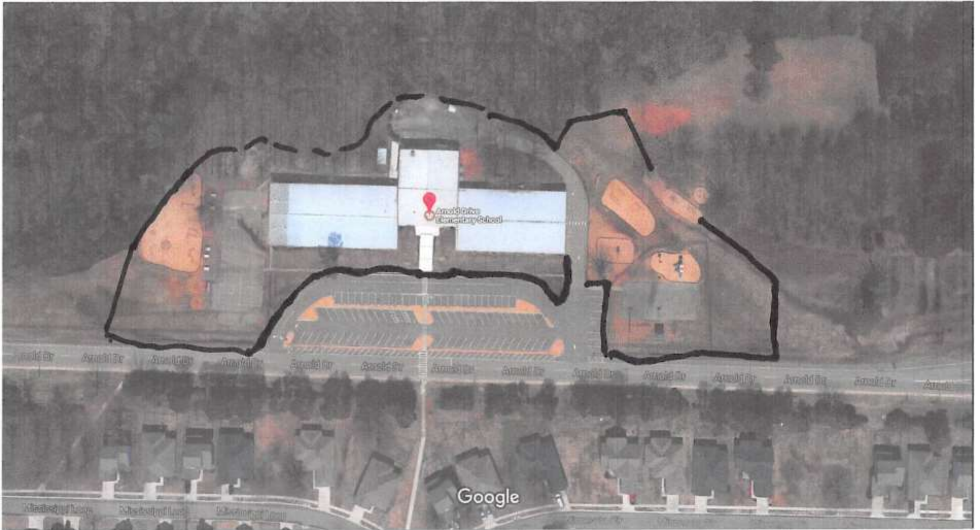
50 ft