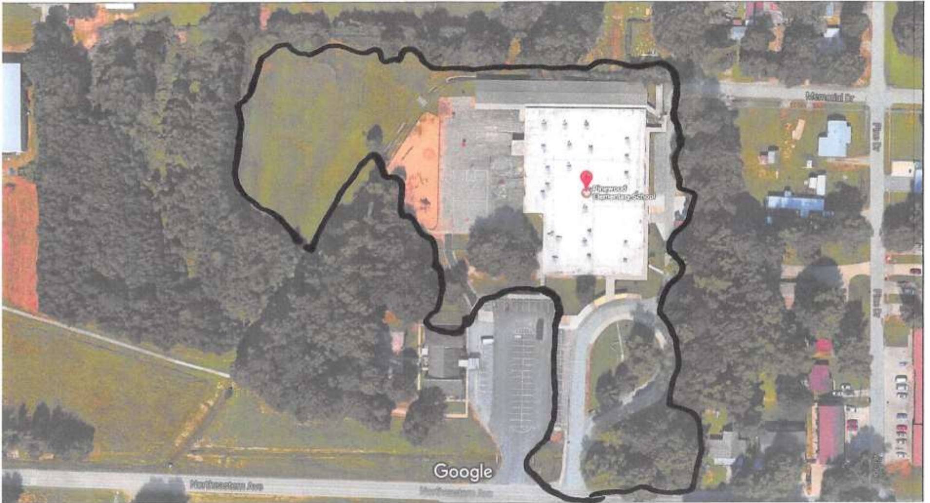
Im age ry ©2017 Google, Ma p data ©2017 Google 50 ft