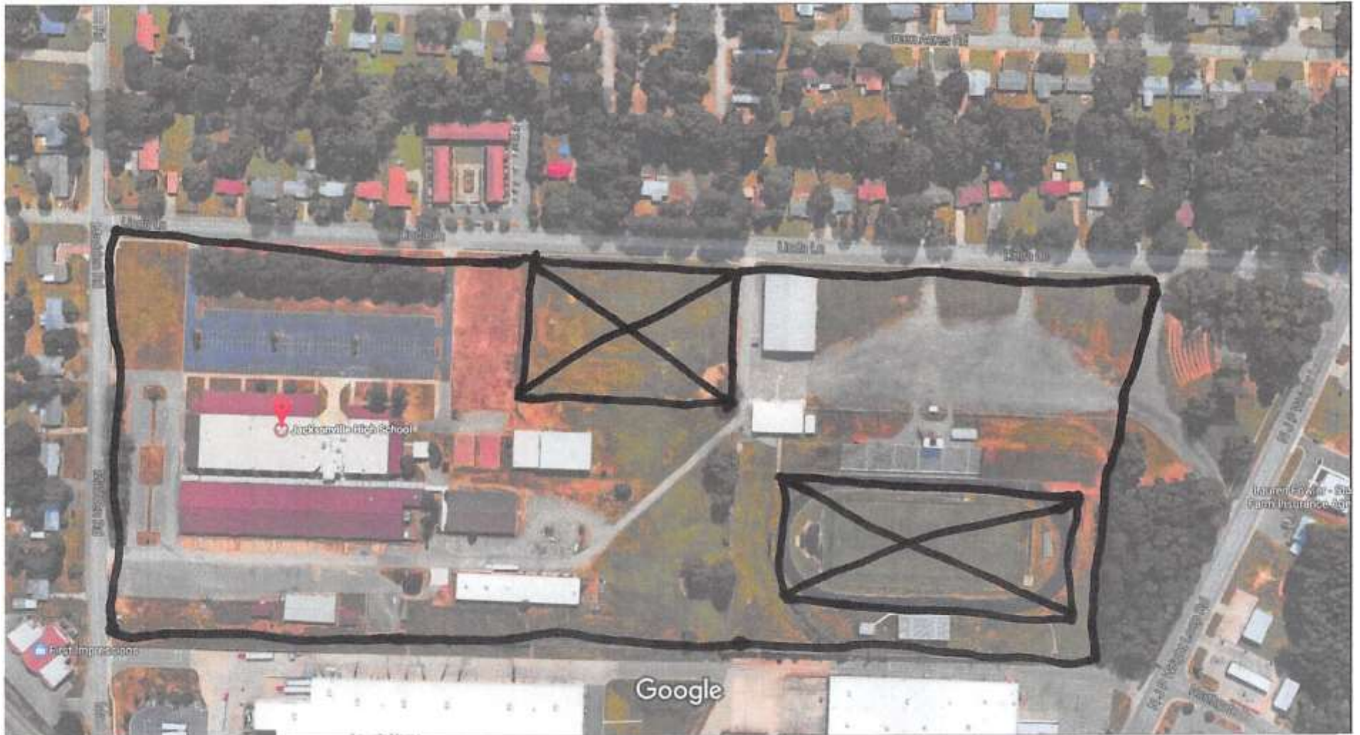
Imagery ©2017 Google, Map data ©2017 Google 100 ft