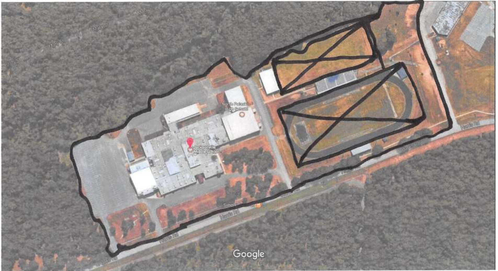
100 ft