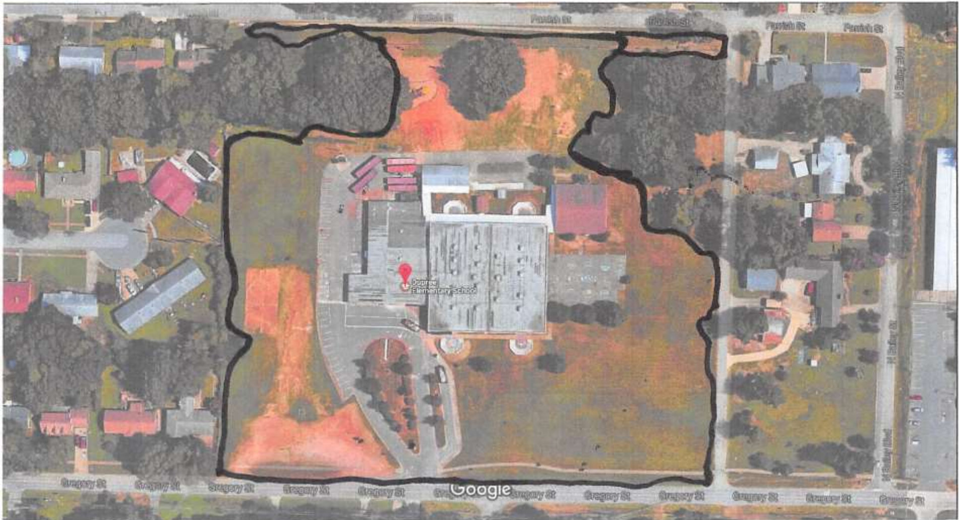
50 ft